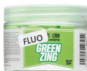
Green Zing Fluo green