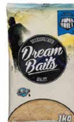
Groundbait Method- and Stickmix