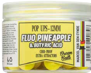
Pineapple and Butyric Acid Fluo yellow