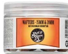
Wafers 15 & 20 mm Semi buoyant hookbait