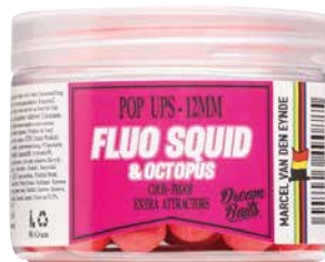
Squid & Octopus Fluo pink