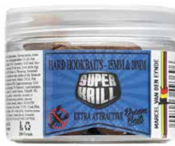
Hard Hookbaits 15 & 20 mm Sinking hard hookbait