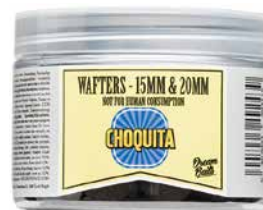
Wafers 15 & 20 mm Semi buoyant hookbait