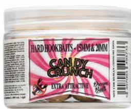
Hard Hookbaits 15 & 20 mm Sinking hard hookbait