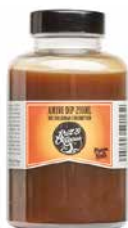
Amino Dip 250 ml Booster liquid