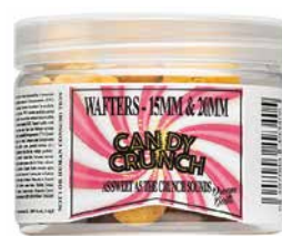
Wafers 15 & 20 mm Semi buoyant hookbait