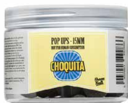
Pop-ups 12 or 15 mm Buoyant hookbait