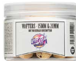
Wafers 15 & 20 mm Semi buoyant hookbait