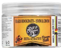
Hard Hookbaits 15 & 20 mm Sinking hard hookbait