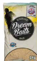
Groundbait Method- and Stickmix