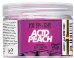
Acid Peach Purple