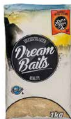
Groundbait Method- and Stickmix