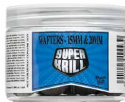
Wafers 15 & 20 mm Semi buoyant hookbait