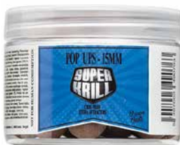
Pop-ups 12 or 15 mm Buoyant hookbait