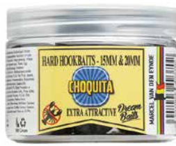
Hard Hookbaits 15 & 20 mm Sinking hard hookbait