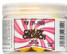
Pop-ups 12 or 15 mm Buoyant hookbait