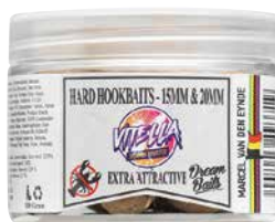
Hard Hookbaits 15 & 20 mm Sinking hard hookbait