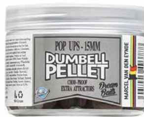
Dumbell Pellet Brown