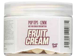
Fruit Cream White