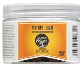
Pop-ups 12 or 15 mm Buoyant hookbait