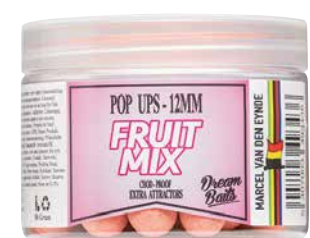
Fruit Mix Washed out pink