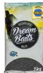
Groundbait Method- and Stickmix