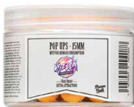
Pop-ups 12 or 15 mm Buoyant hookbait