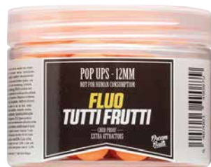
Tutti Frutti Fluo orange