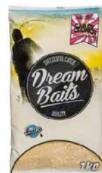
Groundbait Method- and Stickmix